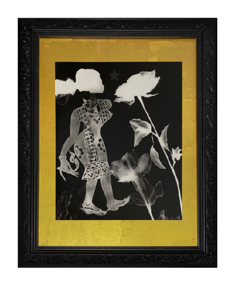
#8 2021 PHOTOGRAM 38X27CM