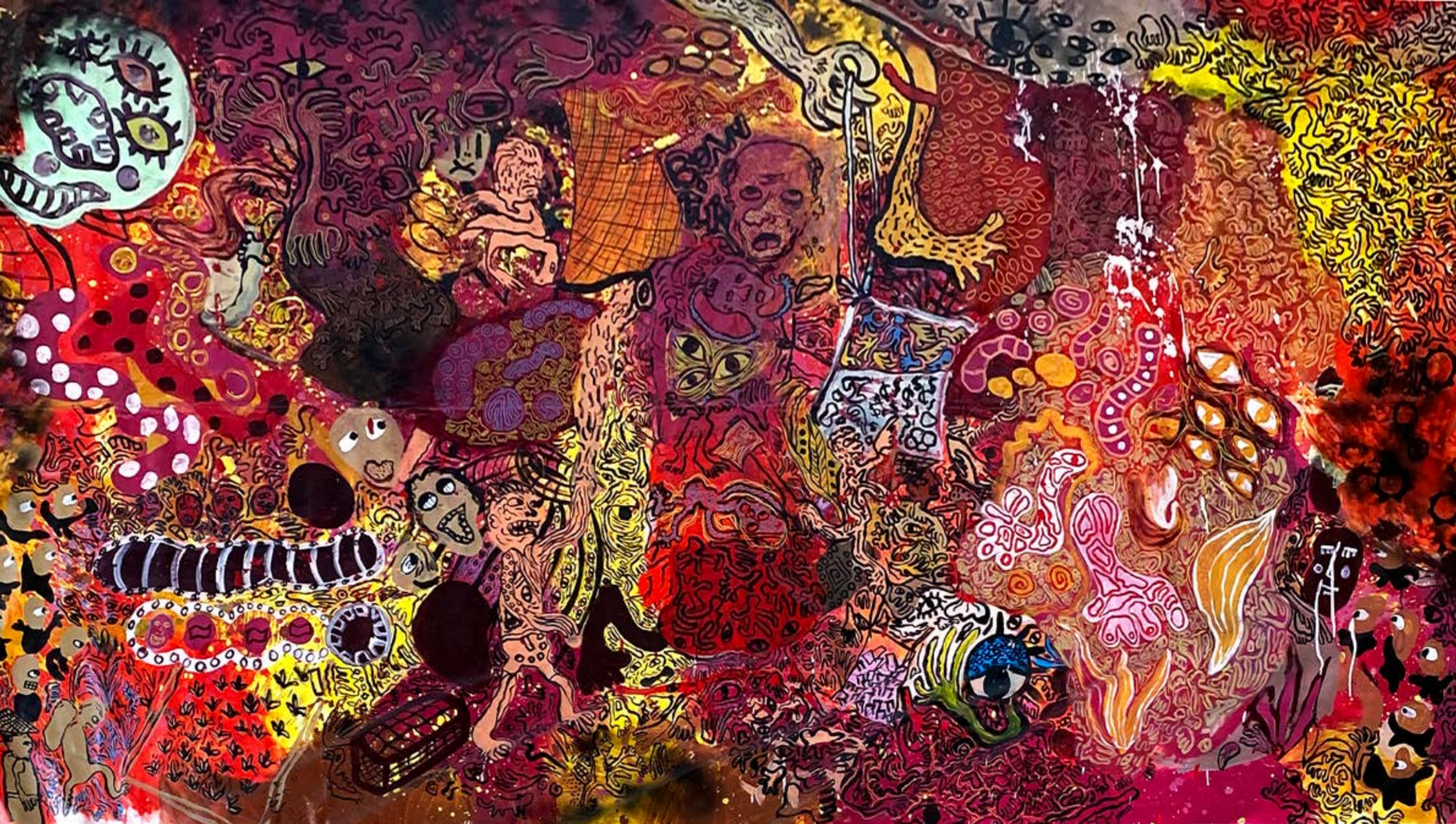
Zharfan Rashidi The Rhythm of Soul 2022, 174x335cm Acrylic on Canvas