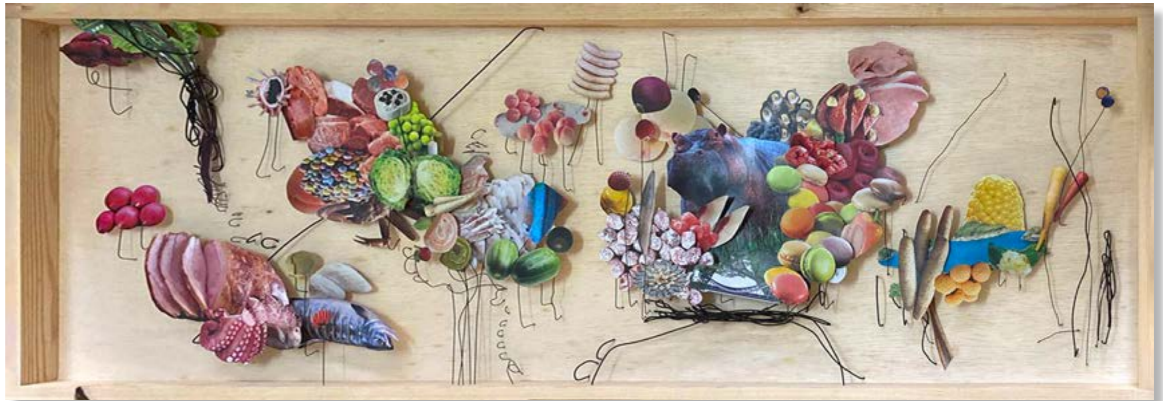
Tan Ru Yi Unknown Reality 2017, 45x130cm Mixed Media

A Malaysian conceptual artist based in Japan, Tan works through her felicitous percipience in collecting the poetic quality of daily things and collating the elements to form collages, sculptures and installations.