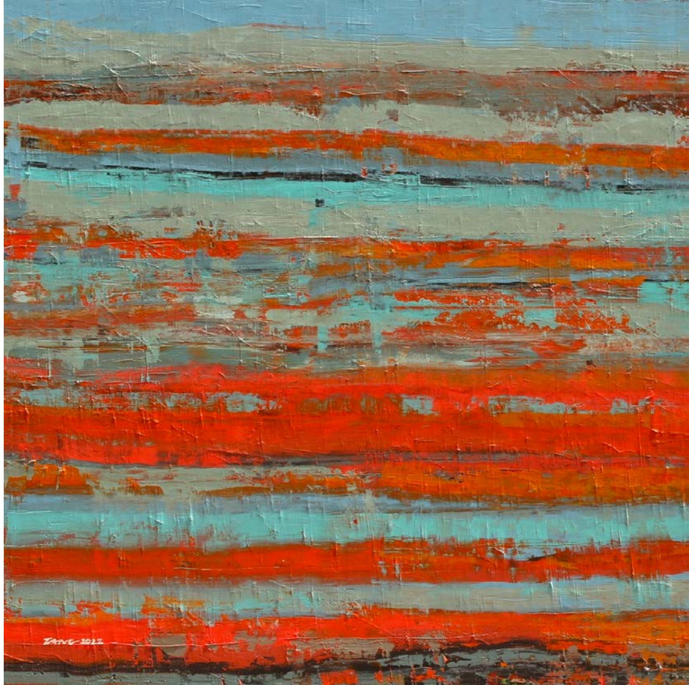
Tang Hon Yin Passing Through #24 2022, 144x144cm Acrylic on Canvas