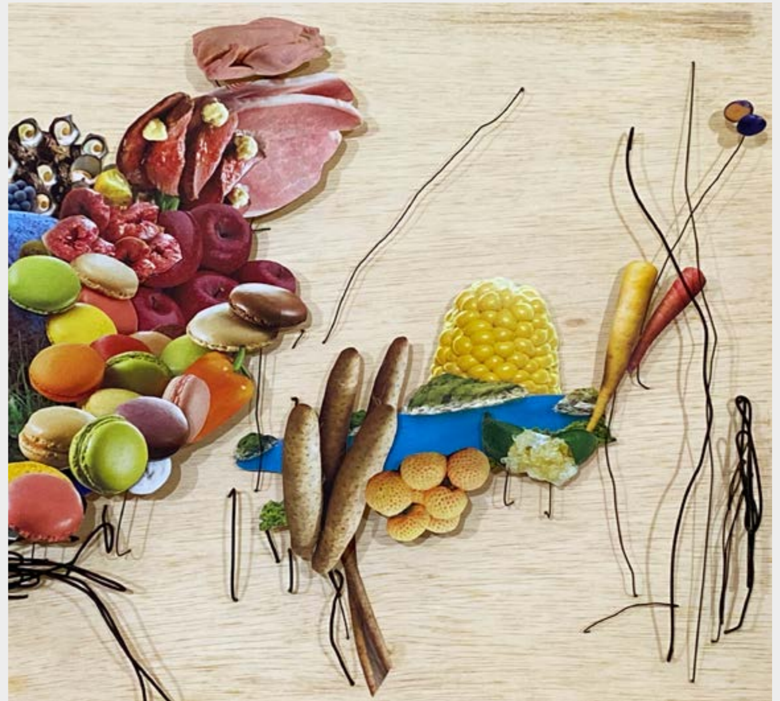
Tan Ru Yi Details, Unknown Reality 2017, 45x130cm Mixed Media